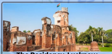
The Residency, Lucknow