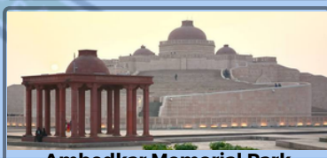
Ambedkar Memorial Park