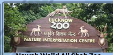
Nawab Wajid Ali Shah Zoo