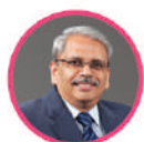
Shri. Kris Gopalakrishnan Former CEO, Infosys & Chairman, Axilor Ventures